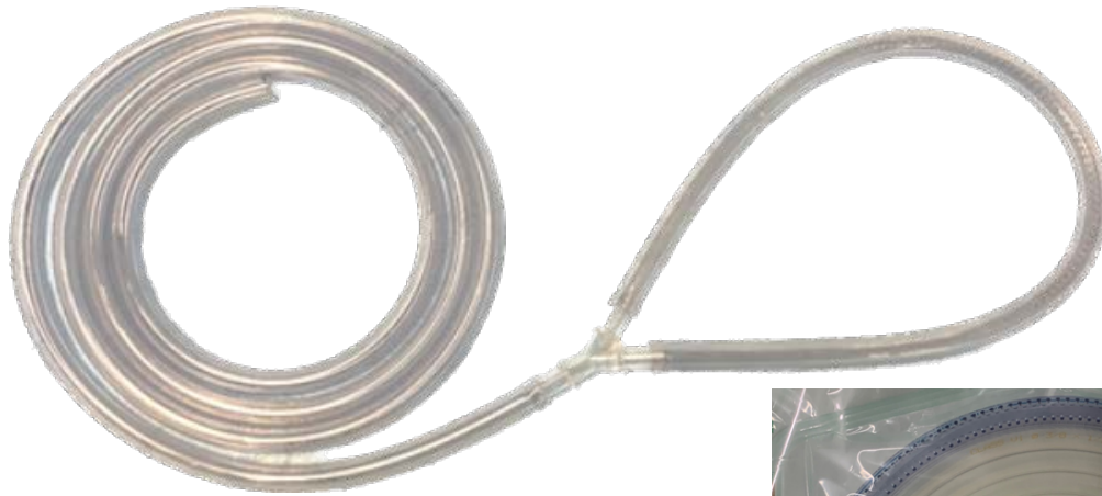
Long Lasso Tubing

The ThermoChem™ System by ThermaSolutions was the first fully integrated system specifically designed and manufactured for intraperitoneal hyperthermia. By exploiting heat and harnessing its power, this advanced medical technology offers a new choice in adjunctive surgical therapies. Used intraoperatively, all ThermoChem™ devices and associated disposables, raise the temperature in the peritoneum by continuously circulating fluids throughout the peritoneal cavity as part of the HIPEC procedure.